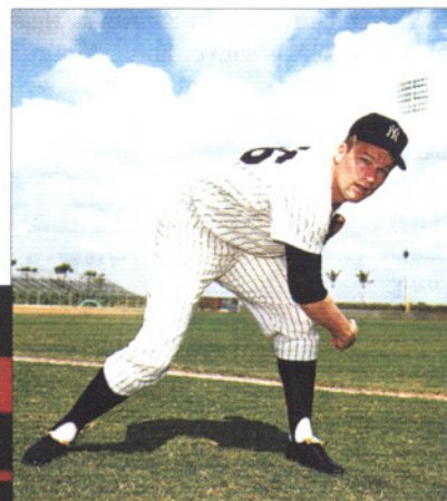
Jim Bouton (today and hurling in the 1960s), a 21-game winner for the New York Yankees in 1963, later wrote the popular book Ball Four and now a new saga in a minor-league key.